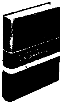
Single volume of entire N.T

This new one-volume edition is the product of many years of dedicated study, research and insight. It contains the entire New Testament in both the King James and Revised Versions, in parallel columns for ready reference and comparison. A verse-by-verse study on the same page with the text. A very popular commentary.